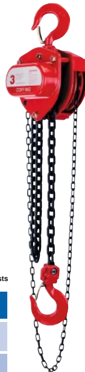
1/2 - 50 Ton